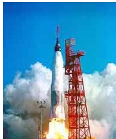
50th Anniversary Mercury 7